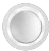
Desired temperature and flow have been reached