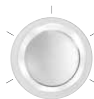
White light flashes while filling to pre-set depth (bath only)