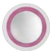
Programming mode (bath only)