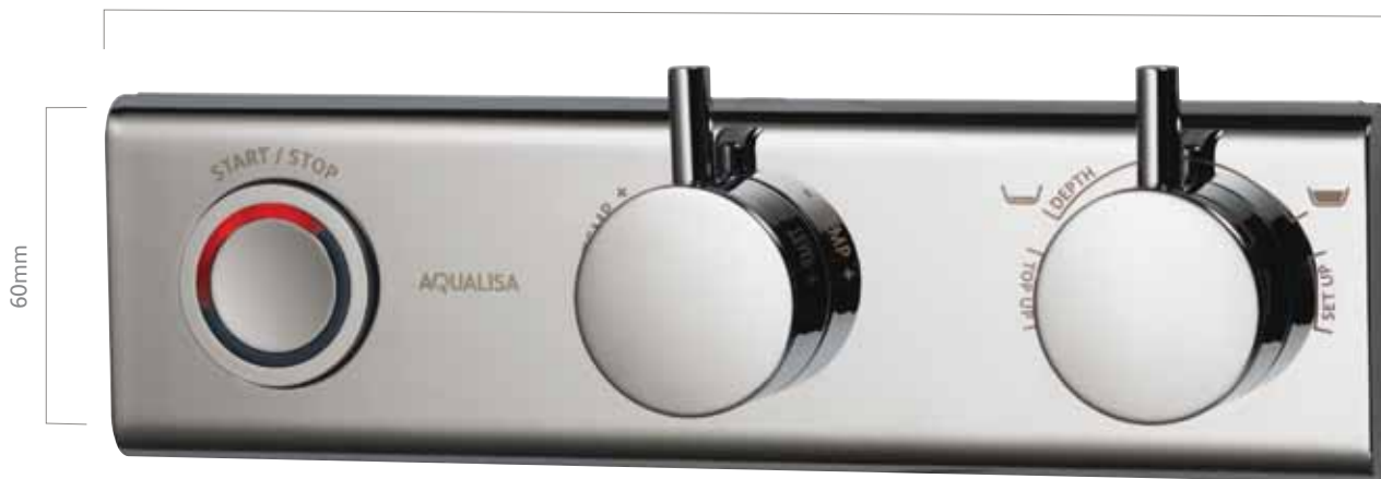
One touch start/stop button